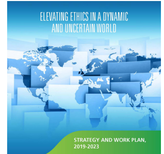
IESBA 2019 - 2023 Strategy and Work Plan