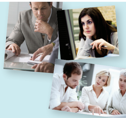
Exhibit 3: Common Judgment Tendencies that Can Lead to Bias and Weaken Skepticism

A lack of knowledge and experience can affect the appropriate exercise of professional skepticism. The use of the apprenticeship model in public accounting involves the use of relatively inexperienced staff auditors whose lack of relevant knowledge and process expertise can limit their ability to effectively apply professional skepticism. Junior auditors are typically not responsible for the most complex audit areas, and they can in many instances bring a fresh perspective. However, they might in some circumstances struggle to understand technical accounting and auditing standards, audit firm policies and procedures, jargon, terms, or underlying economics. When substantial cognitive effort is applied to simply understand the issues and apply