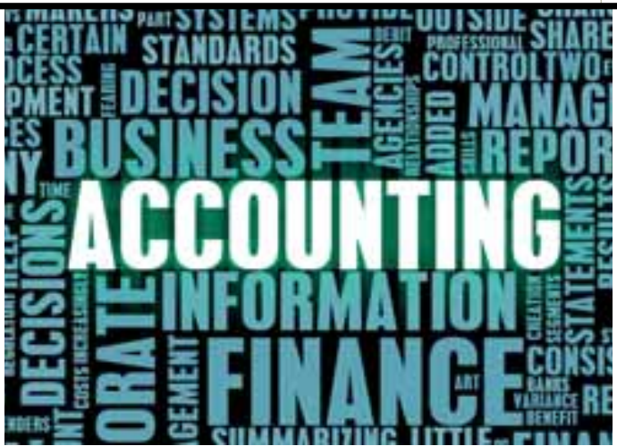
Focus on a specific industry sector or specialization

as "We are dedicated to adding and sustaining value for families and their businesses."