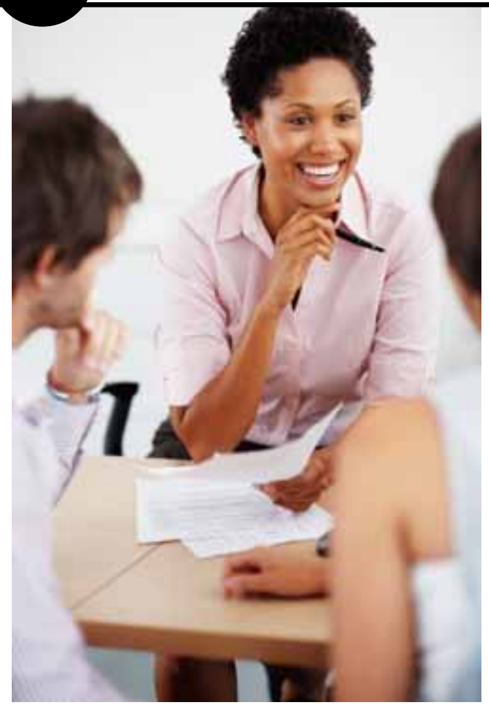
Promoting and marketing your practice, and the value of your services, will be crucial to success.