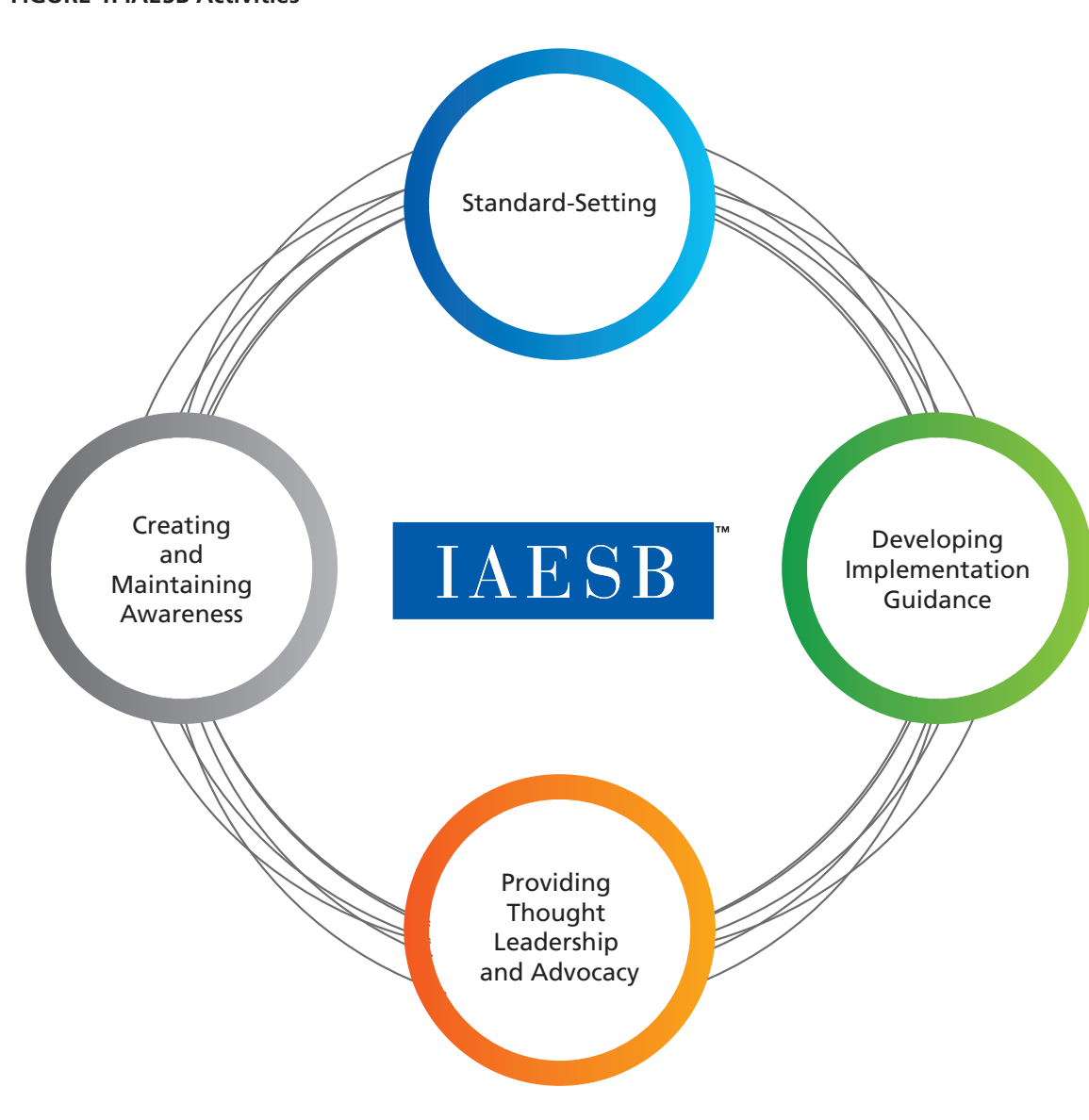
FIGURE 1: IAESB Activities

The structures and processes that support the operations of the IAESB are facilitated and supported financially by IFAC. The IAESB is a component of the overall IFAC reporting entity; accordingly, its financial